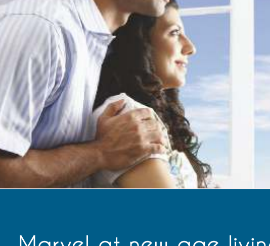
Chart on a course that sets your pulse racing.